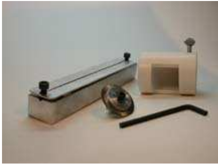
Koil Cutter $79.95

Gemstones Etc. 3649 N. Pellegrino Drive Tucson AZ 85749 520-749-2413 E-mail: gemstonesetc@gainbroadband.com