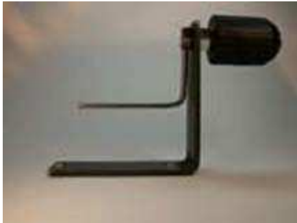
Koil Winder $26.95

Specify set desired, metric or English, when ordering.