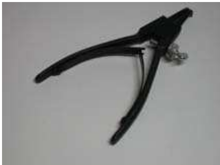
Link Stretching Pliers $17.95

A manual winder that can be clamped or mounted permanently, to a work surface or held in a vise. It will accommodate all the mandrels in the Koil Mandrel & Mini Mandrel sets.