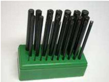
Koil Mandrels $39.95

A device to easily and safely cut coils of wire into rings. The device attaches to any 1 inch (25 mm) diameter flexshaft hand piece, e.g. # 30 Foredom hand piece, or motor tool, e.g. Proxxon, Dremel, or equal. The device consists of a replaceable cutter blade mounted on an arbor, a cutter guide, a coil holder, wrenches appropriate to the model & a set of instructions.